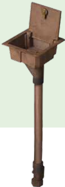
Sanitary Post and Yard Hydrants