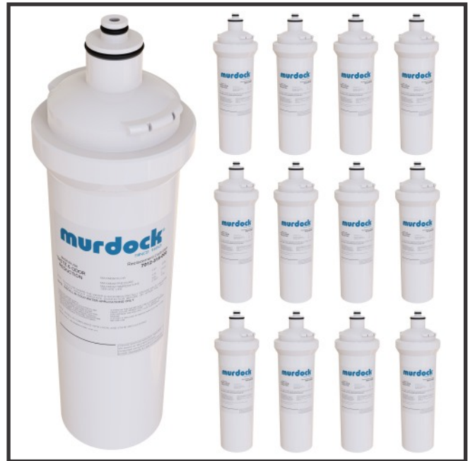
RWF3 and RWF3-12 shown