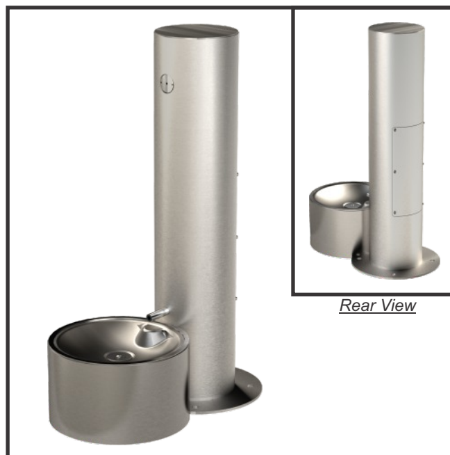
Model M-PM34 Shown

Unit shall be constructed of 14 gage type 304 stainless steel polished to a satin finish with 18 gage pet fountain bowl. Bottom plate shall be 3/16" thick and include three mounting holes with two additional mounting holes for pet fountain. 1/2" expansion anchor bolts shall be furnished. All other exposed fasteners shall be vandal resistant stainless steel screws.