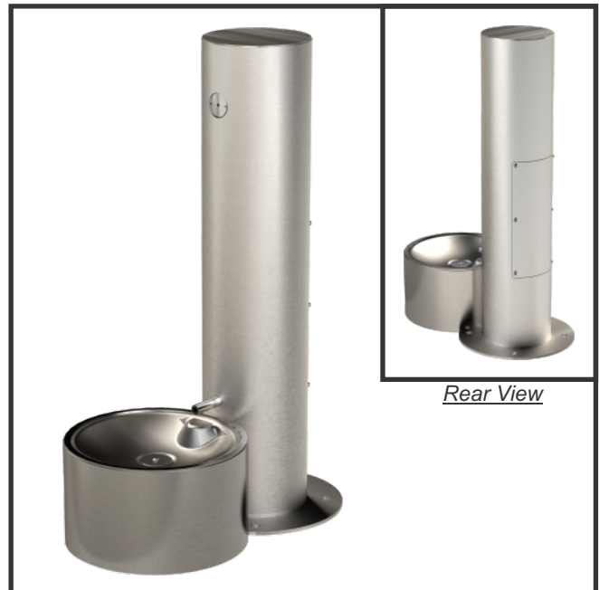
Model M-PM34 Shown

Unit shall be constructed of 14 gage type 304 stainless steel polished to a satin finish with 18 gage pet fountain bowl. Bottom plate shall be 3/16" thick and include three mounting holes with two additional mounting holes for pet fountain. 1/2" expansion anchor bolts shall be furnished. All other exposed fasteners shall be vandal resistant stainless steel screws.