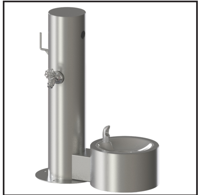
Model M-PM14 Shown

Unit shall be constructed of 14 gage type 304 stainless steel polished to a satin finish with 18 gage pet fountain bowl. Bottom plate shall be 3/16" thick and include three mounting holes with two additional mounting holes for pet fountain. 1/2" expansion anchor bolts shall be furnished. All other exposed fasteners shall be vandal resistant stainless steel screws.