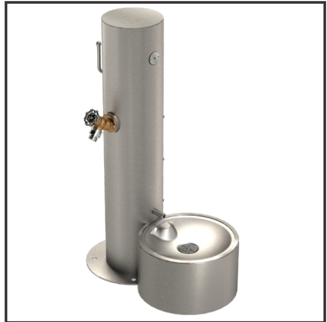
Model M-PM14 Shown

Unit shall be constructed of 14 gage type 304 stainless steel polished to a satin finish with 18 gage pet fountain bowl. Bottom plate shall be 3/16" thick and include three mounting holes with two additional mounting holes for pet fountain. 1/2" expansion anchor bolts shall be furnished. All other exposed fasteners shall be vandal resistant stainless steel screws.