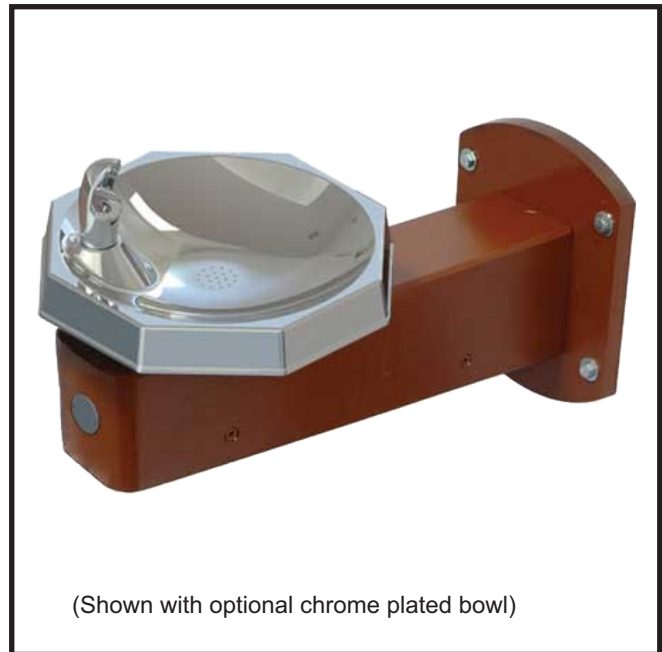
(Shown with optional chrome plated bowl)

All solid brass castings shall conform to ASTM standards B61 and B62. Unit is certified to ANSI A117.1, Public Law 111-380 (NO-LEAD), CHSC 116875 and NSF/ANSI 61, Section 9.