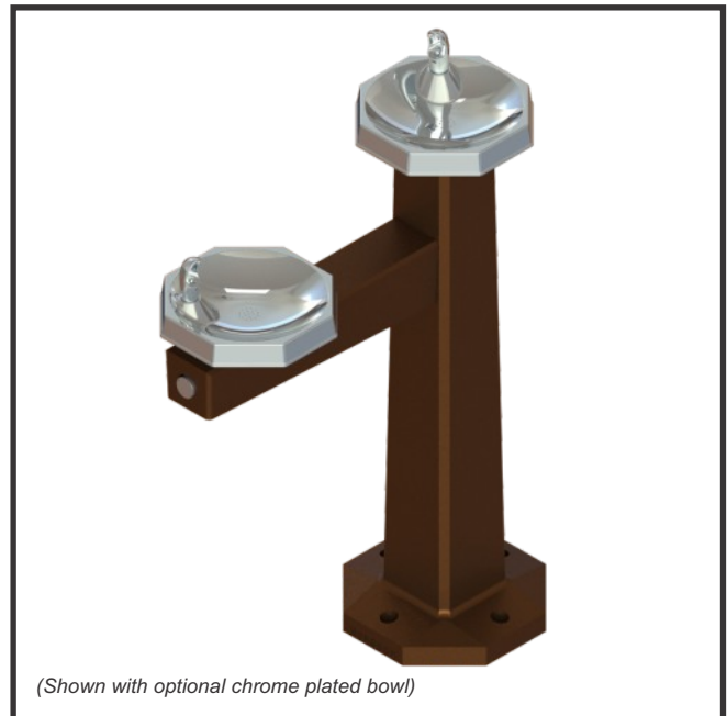
(Shown with optional chrome plated bowl)

All solid brass castings shall conform to ASTM standards B61 and B62. Unit is certified to ANSI A117.1, Public Law 111-380 (NO-LEAD) and NSF/ANSI/CAN 61.