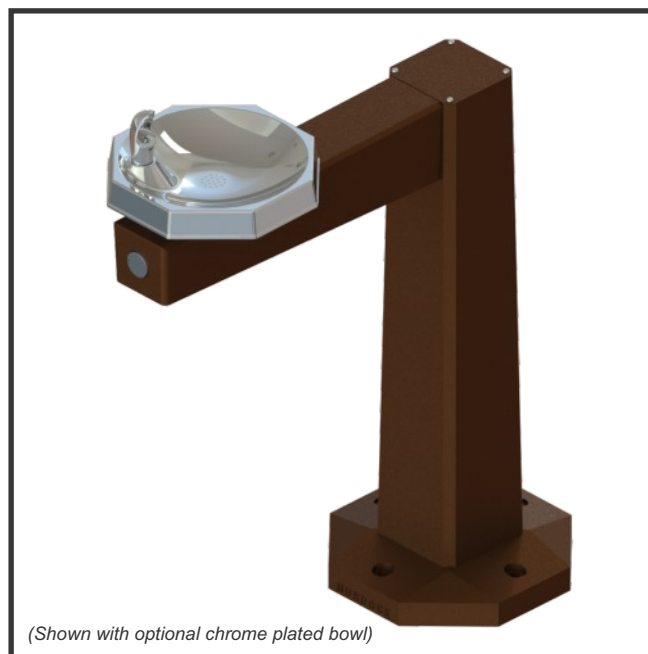
(Shown with optional chrome plated bowl)

All solid brass castings shall conform to ASTM standards B61 and B62. Unit is certified to ANSI A117.1, Public Law 111-380 (NO-LEAD) and NSF/ANSI/CAN 61.