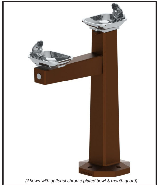
(Shown with optional chrome plated bowl & mouth guard)

All solid brass castings shall conform to ASTM standards B61 and B62. Unit is certified to ANSI A117.1, Public Law 111-380 (NO-LEAD), CHSC 116875 and NSF/ANSI 61, Section 9.