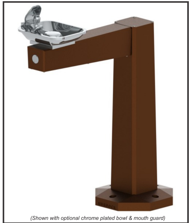
(Shown with optional chrome plated bowl & mouth guard)

All solid brass castings shall conform to ASTM standards B61 and B62. Unit is certified to ANSI A117.1, Public Law 111-380 (NO-LEAD) and NSF/ANSI/CAN 61.