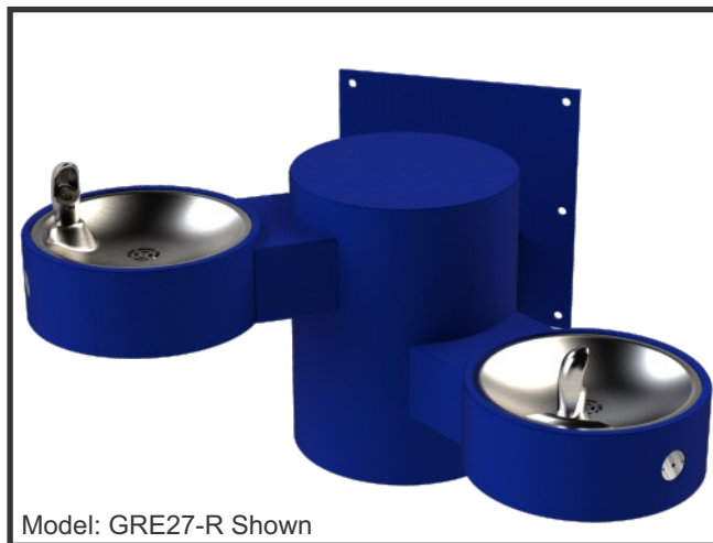
Model: GRE27-R Shown