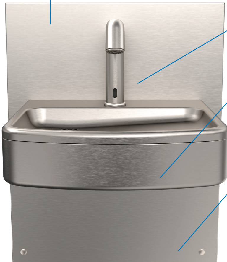
MODEL NO. A191W