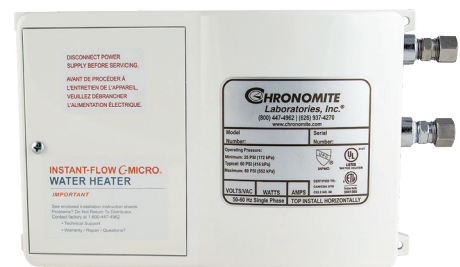
MODEL NO. CM12L/120 104F

ADD A CHRONOMITE® INSTANT-FLOW® C-MICRO POINT-OF-USE THERMOSTATIC TANKLESS WATER HEATER(OPTIONAL)