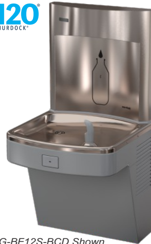
Model A171108F-UG-BF12S-BCD Shown PATENT# 10,100,933 PATENT# D873,606