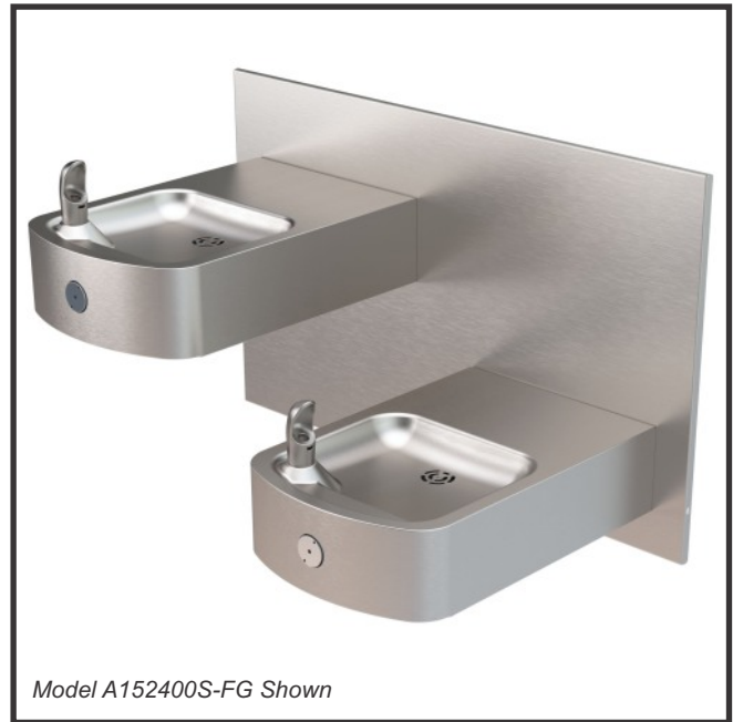
Model A152400S-FG Shown