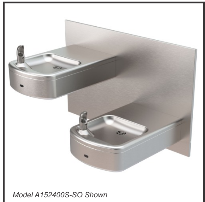
Model A152400S-SO Shown