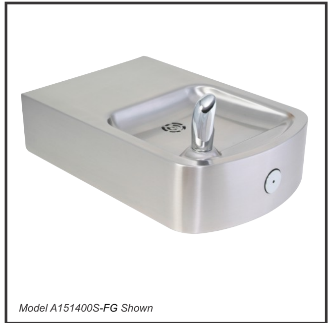
Model A151400S-FG Shown

Compatible Mounting Support Carrier Jay R. Smith Mfg. Co. Figure # 0824 https://www.JRSmith.com