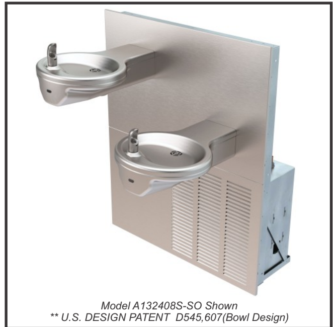
Model A132408S-SO Shown

** U.S. DESIGN PATENT D545,607(Bowl Design)