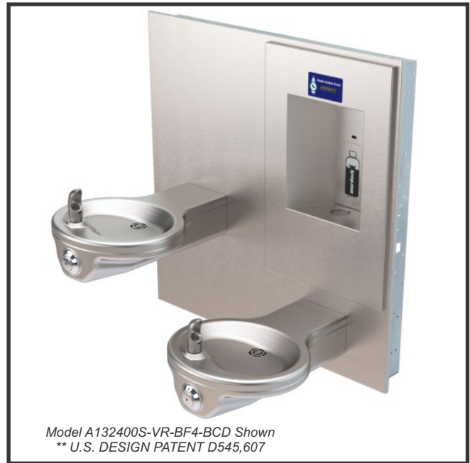
Model A132400S-VR-BF4-BCD Shown ** U.S. DESIGN PATENT D545,607

1 - Refer to Supplemental Submittal Sheets for Details