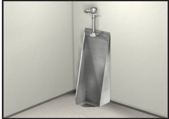
Note: Fixture may show some available options