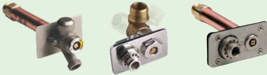
Exposed Wall Hydrants for Freezing and Mild Climates