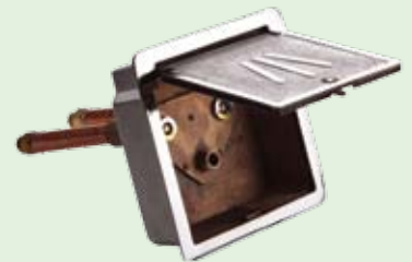
Twin Temp Hydrants