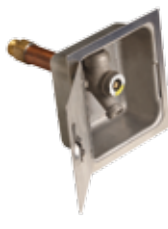
Fig. # M-3509QT Quarter-Turn Wall Hydrant and Box