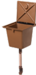
Fig. # M-3950, M-3951 Boxed Type Post Hydrant