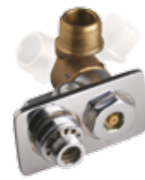
Fig. # M-3618 Narrow Wall, Mild Climate Hydrant