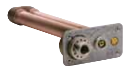
Fig. # M-3615 Guardian Plus Dual Check Hydrant with Integral Stop Water Service Shut-off Valve and Non-Freeze Protection