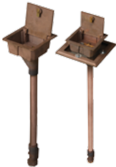
Fig. #M-3810, M-3811, M-3810F, M-3811F Boxed Ground Hydrant

Murdock boxed ground hydrants provide non-freeze protection, several hose connection sizes and heavy duty covers for high traffic areas.