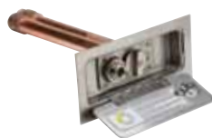
Fig. # M-3515 Guardian Plus Dual Check Hydrant with Integral Stop Water Service Shut-off Valve and Non-Freeze Protection