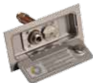
Fig. # M-3519, M-3519QT-NB Guardian Dual Check® Hydrant and Stainless Steel Box