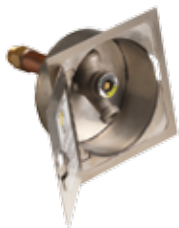
Fig. # M-3509QT-R Cored Hole Hydrant and Box

Murdock commercial boxed hydrants conceal the nozzle and operating mechanism. The locking covers protect against vandalism and unauthorized use.