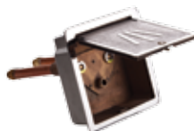
Fig. # M-3560QT Twin-Temp Hydrant