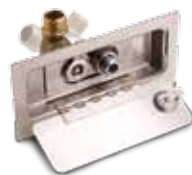
Fig. # M-3518 Narrow Wall Warm Climate Hydrant and Box with 360° Inlet Connection