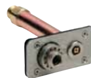
Fig. # M-3619 Guardian Dual Check Hydrant