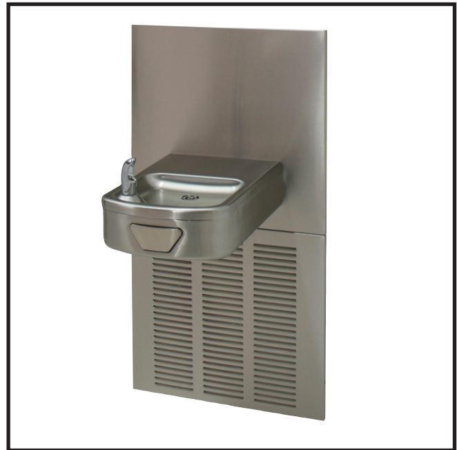
"INDOOR USE ONLY"