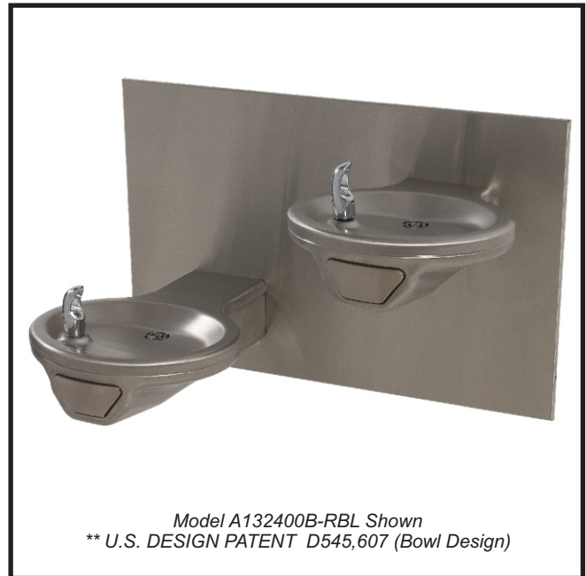
Model A132400B-RBL Shown ** U.S. DESIGN PATENT D545,607 (Bowl Design)