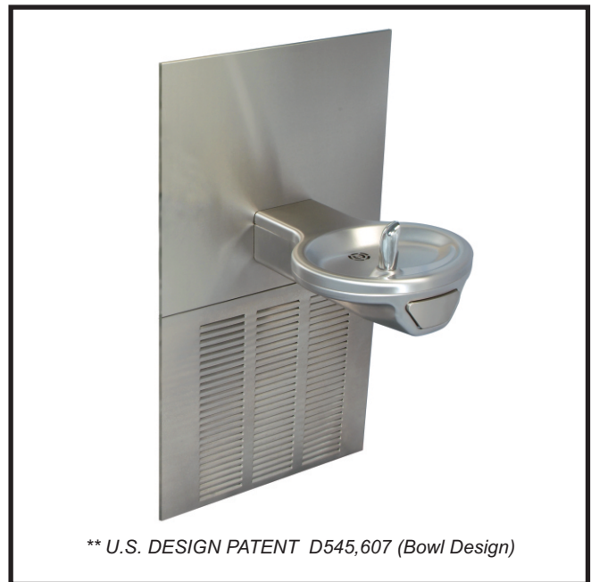
** U.S. DESIGN PATENT D545,607 (Bowl Design)

Model A131408S is a wall mounted, pressurized electric drinking fountain that shall deliver a minimum of 8.0 GPH (30.3 LPH) of water at 50°F (10°C) cooled from 80°F (26.7°C) inlet water and 90°F (32.2°C) ambient. Unit shall be made from 18 gage, 304 stainless steel with a brushed finish. Unit shall be activated by a self-closing, frontal push pad, by using less than 5 pounds of force, which activates an internally mounted valve with an adjustable stream regulator controlling the water flow. Cooling system shall use R-134a refrigerant and be capillary tube regulated. An adjustable thermostat with an off position shall regulate the refrigeration system. Bubbler shall be polished stainless steel with a non-squirt feature and operate on a water pressure range of 20-105 psig. Unit shall have a uniquely designed, two-piece contoured bowl with P-trap integral to the unit. Unit shall be listed by Underwriters Laboratories for both the US and Canada and is compliant to the Air Conditioning and Refrigeration Institute Standard 1010. Unit is certified to ANSI A117.1, Public Law 111-380 (NO-LEAD), CHSC 116875 and NSF/ANSI 61, Section 9. Fixture meets ADA, ADA Standing Person, and ADA Child requirements when mounted appropriately.